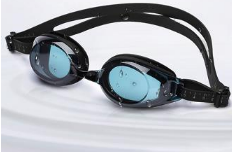
YPC001 Collection(swimming goggles)